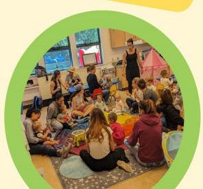
Tots (ages 0-4) Classes