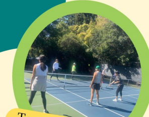
Tennis & Pickleball Classes