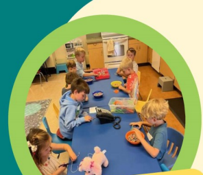
Kids Club Afterschool!