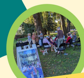
Adult & Senior Classes