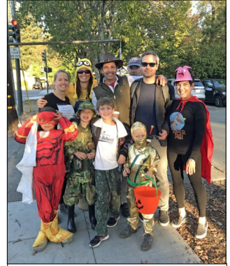
Halloween Trick or Treaters

Post Office and the tennis courts. This would involve moving the creek bed east, closer to the houses on Sir Francis Drake Blvd, and moving the bike path west toward Poplar Avenue. Most of the existing trees and vegetation along the creek sides and bike path would be removed during the excavation to create the new creek bed. Following construction, the area would be re-landscaped with trees and shrubs to restore a park-like appearance. There will be a walk-through of the project area on Saturday November 18 from 10am-noon starting at the post office. A Town Council decision about whether to proceed with the project is expected in December.